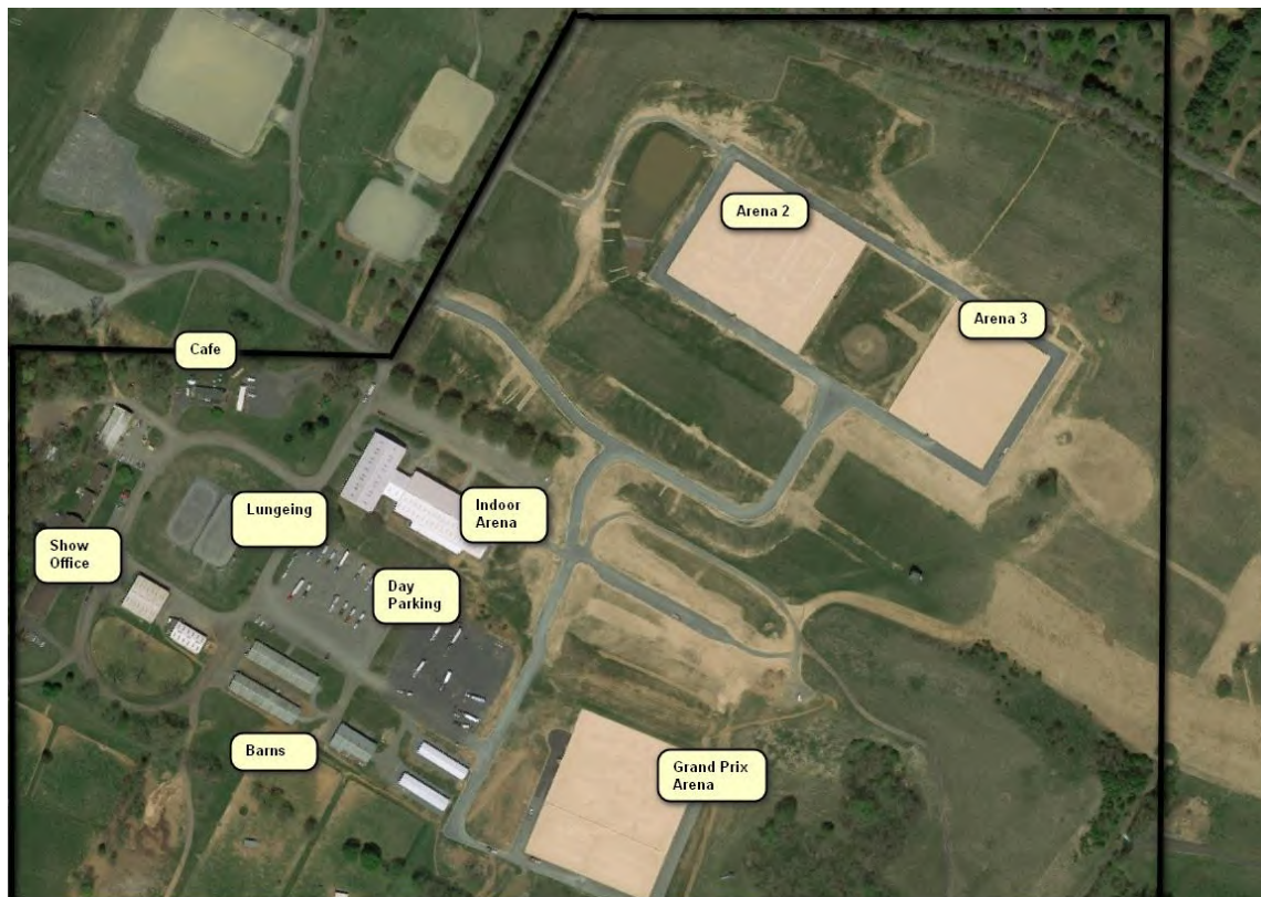
Map of Morven Park International Equestrian Center

Complete Award/Championship Requirements Listed in the current USDF Member Guide