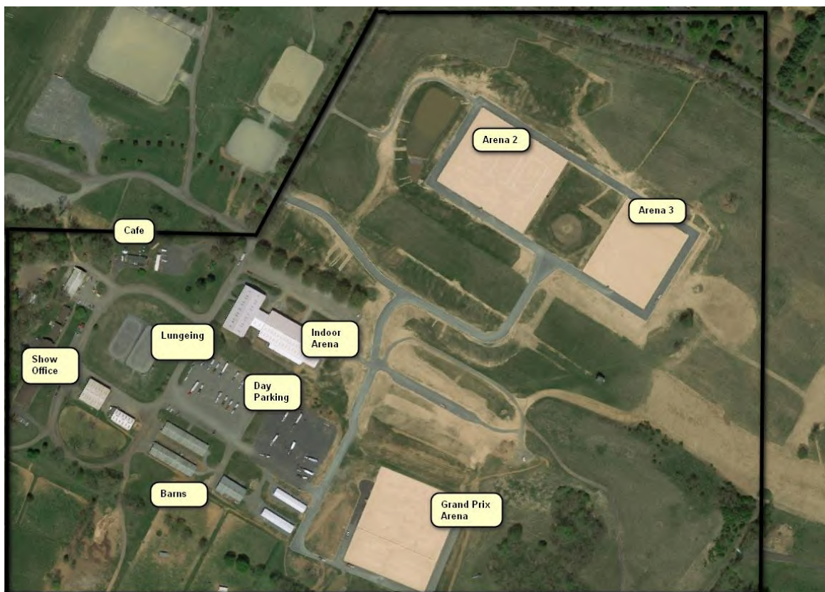
Map of Morven Park International Equestrian Center

Complete Award/Championship Requirements Listed in the current USDF Member Guide