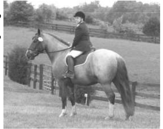
Our first show-Compass Rose -May 2009