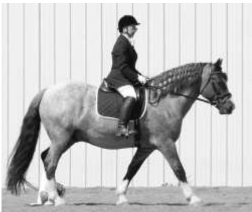
Homestead show-September 2009

I've had several special horses throughout the years but Ziggy was by far the one with whom I've felt the deepest connection and he'll stand head and shoulders above the rest. Some people search in vain for that "one and only" and I was fortunate to not only find mine but enjoy him for almost nine years. As the pain of losing him eases over time, the memories will be oh so sweet.